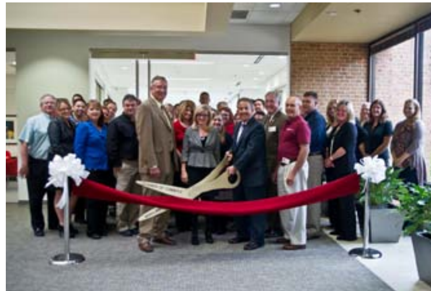
CI Select Ribbon Cutting