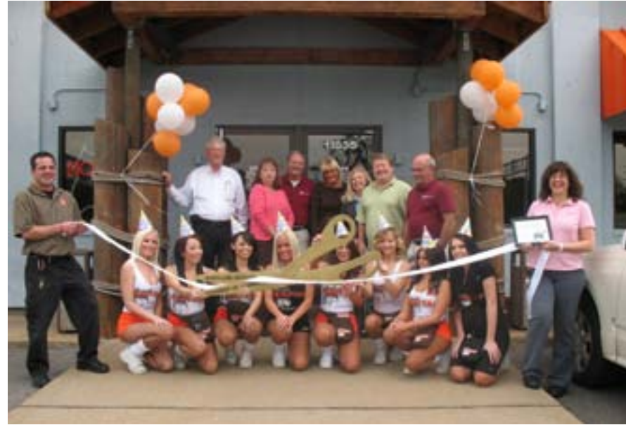
Hooter's 20th Anniversary Ribbon Cutting

For a complete list of all members, log onto the directory at www.mhcc.com .